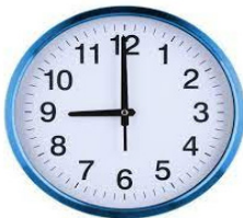
9:00am Chapel on the Beach