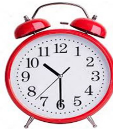
10:30am Worship in the Chapel