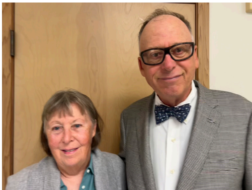
Margo & Andy Dufresne