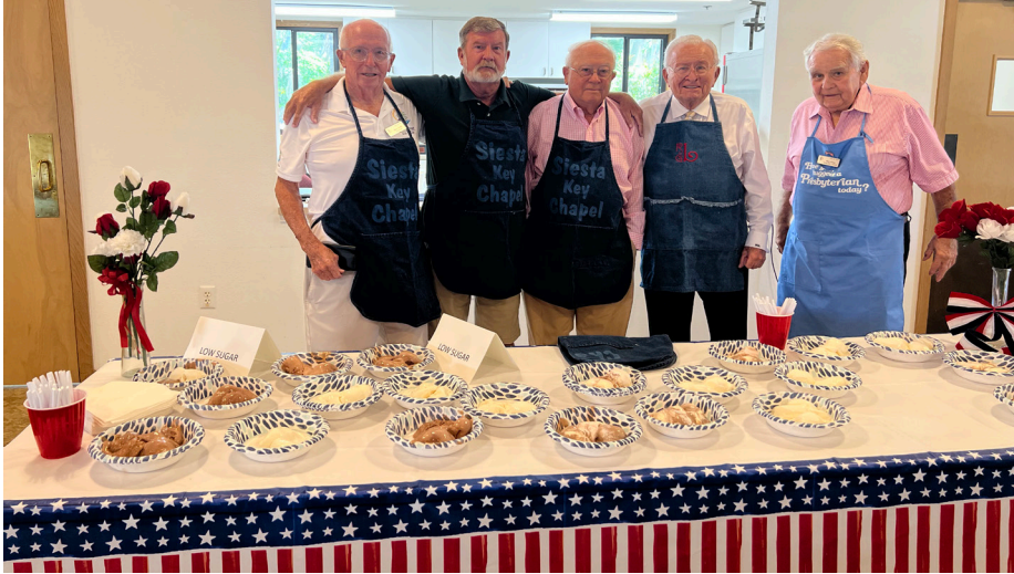
Ice Cream Social - May 28

Men's Fellowship is a Christian organization for the men of Siesta Key Chapel and their male friends. The group will take a Summer hiatus and start again in the fall on the 2nd and 4th Tuesday of the month. The gatherings begin at 8:00 AM with a light breakfast and Christian fellowship, current topics, study, and stories. All men are welcome and it is a wonderful way to start the day, with good old-fashioned fun and laughter in a relaxed atmosphere.