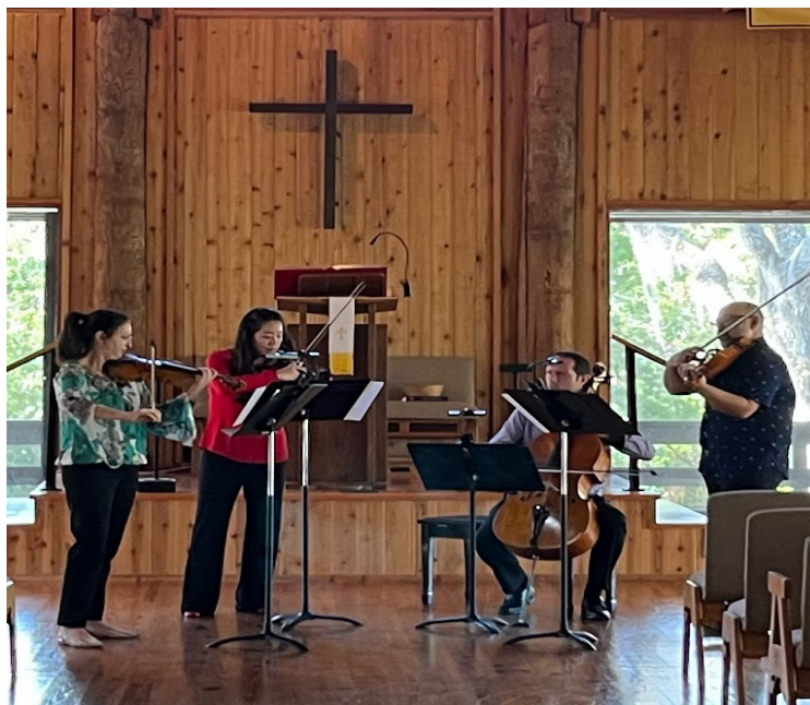
Chamber Music Society of Sarasota